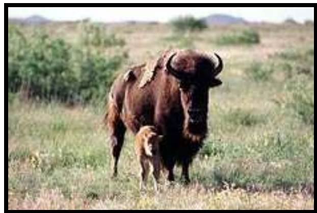
Caprock State Park

When the Santa Fe expedition arrived at the location they gazed upon a procession of 10,000 Indians coming out to meet them being led by Indians carrying two large wooden crosses. Altars were built, covered by an arbor of branches and flowers. To the priest's amazement, the Indians came up to genuflect and kiss their crucifixes. The priests were truly stunned.