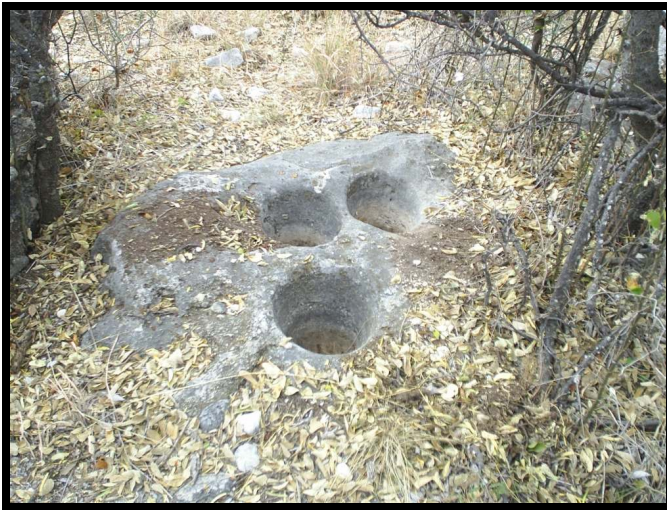
Jumano grinding holes on Dove Creek

The Jumano were a fair skinned Indian with a pleasant disposition. The men cut their hair short in a bowl like shape and the women wore their hair long. They preferred to tattoo their bodies with decorations, making them very distinctive in appearance.