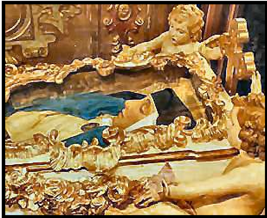
The casket of Mary of Agreda

Mary of Agreda was bestowed the title of “Venerable” by the Church, a person who has been posthumously declared "heroic in virtue" during the investigation and a process leading to canonization as a saint. There is an ongoing movement around the world to bring her to full sainthood.