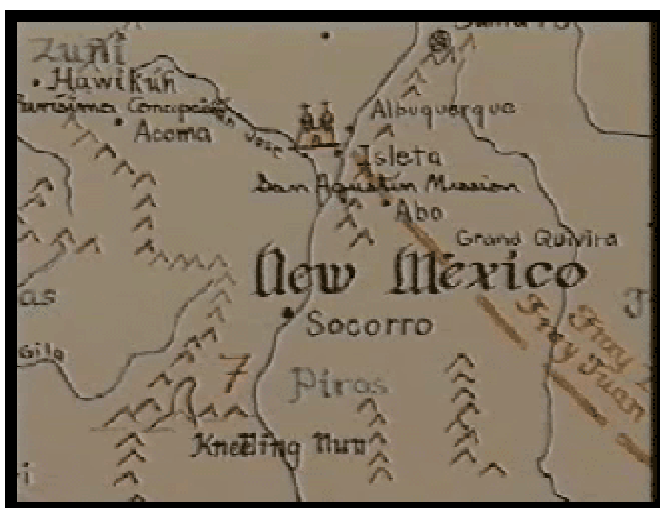
Original map of the New Mexico mission location