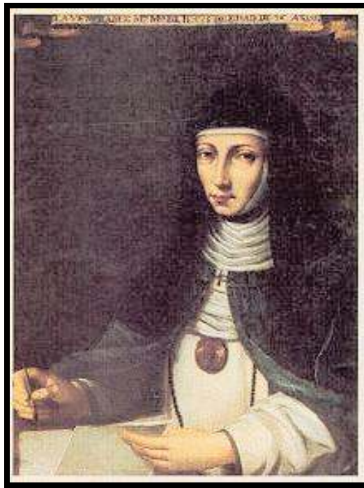
Portrait of Mary of Agreda at age 36

Although Mary's visits to the American Southwest ended in 1631 she continued to bless the Church with her visions and religious powers of insight. She penned one of the Church's most powerful writings, 'The Mystical City of God,' an 8-book narrative of her direct revelations from Mary, mother of Jesus.